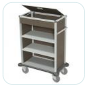
Amenities compartment lid