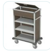
Amenities compartment lid and stationery drawer