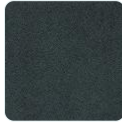
Black caviar look