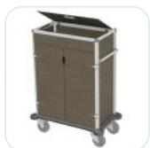
Amenities compartment lid and doors