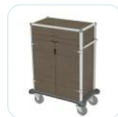
Amenities drawer, stationery drawer and doors