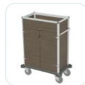
Stationery drawer and doors