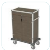
Amenities drawer and doors