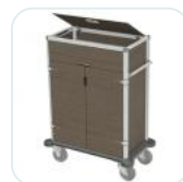
Amenities compartment lid, stationery drawer and doors