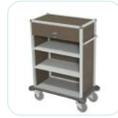
Amenities and stationery drawer